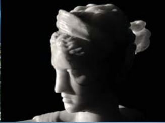
Rendering translucent marble using computer graphics