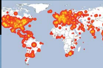
Tracking Internet worm epidemics